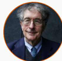
Dr. Howard Gardner

Creativity, MultiPotentiality, and Supporting Student Interests