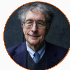
Dr. Howard Gardner

Education, Leadership, AI, and Transformational Creativity (Double Espresso)