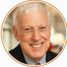
Dr. Robert Sternberg

SPECIAL: Teaching for Creativity and Teaching Creatively in Higher Education